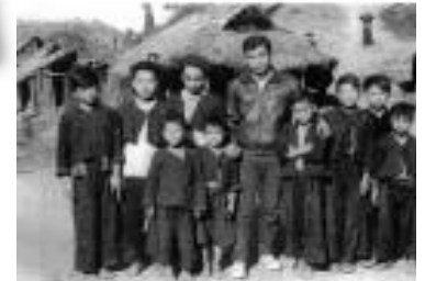
At various development activities in Laos during the 1960s with young people